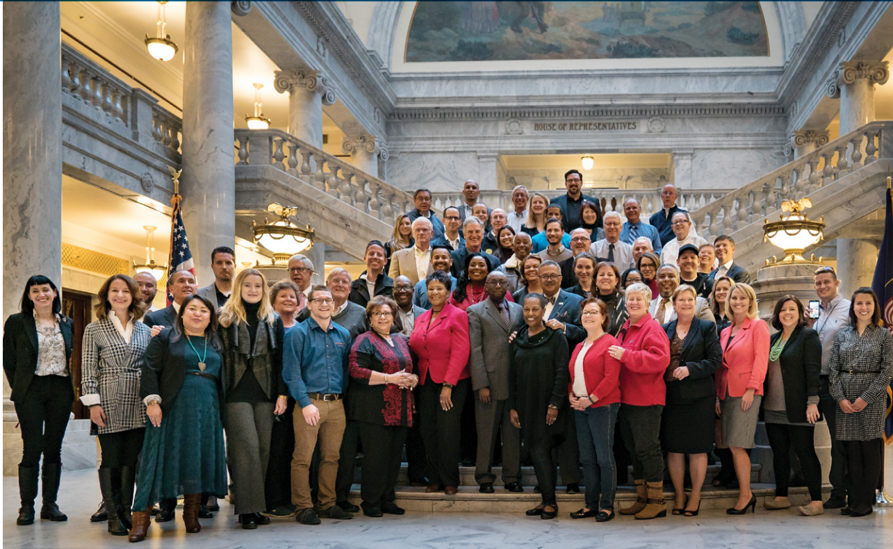
LUCC members at the 2017 Symposium in Salt Lake County, Utah

America's urban counties play a prominent role in the lives of 156 million residents every day. We foster conditions for economic strength, build and maintain transportation systems and critical infrastructure, promote community health and well-being, champion justice and public safety and implement a broad portfolio of federal, state and local programs.