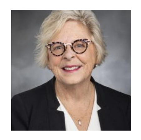
Hon. Claire Wilson Senator, 30<sup>th</sup> Legislative District Washington State