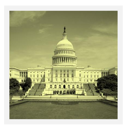
State Voice in D.C.

NCSL delivers training tailored specifically for legislators and staff