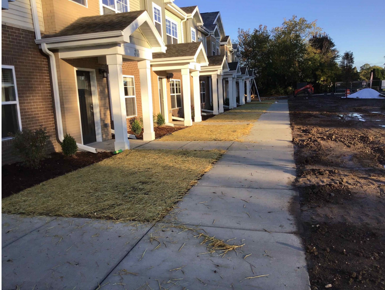
Muskego School Apartments, Completed