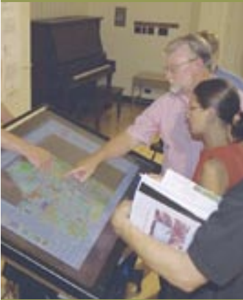
This Smart Board with a plasma screen viewer can be utilized at community meetings to help incorporate wetland data into county planning processes.

Accumulating wetlands data and producing accurate maps is a key step in the protection of a county's wetlands; however, it is just one step. Counties have multiple options available to them to protect their wetlands. Accurate and usable wetlands data allows communities to exercise their options with the confidence that they possess the data necessary to effectively and accurately protect this valuable resource.