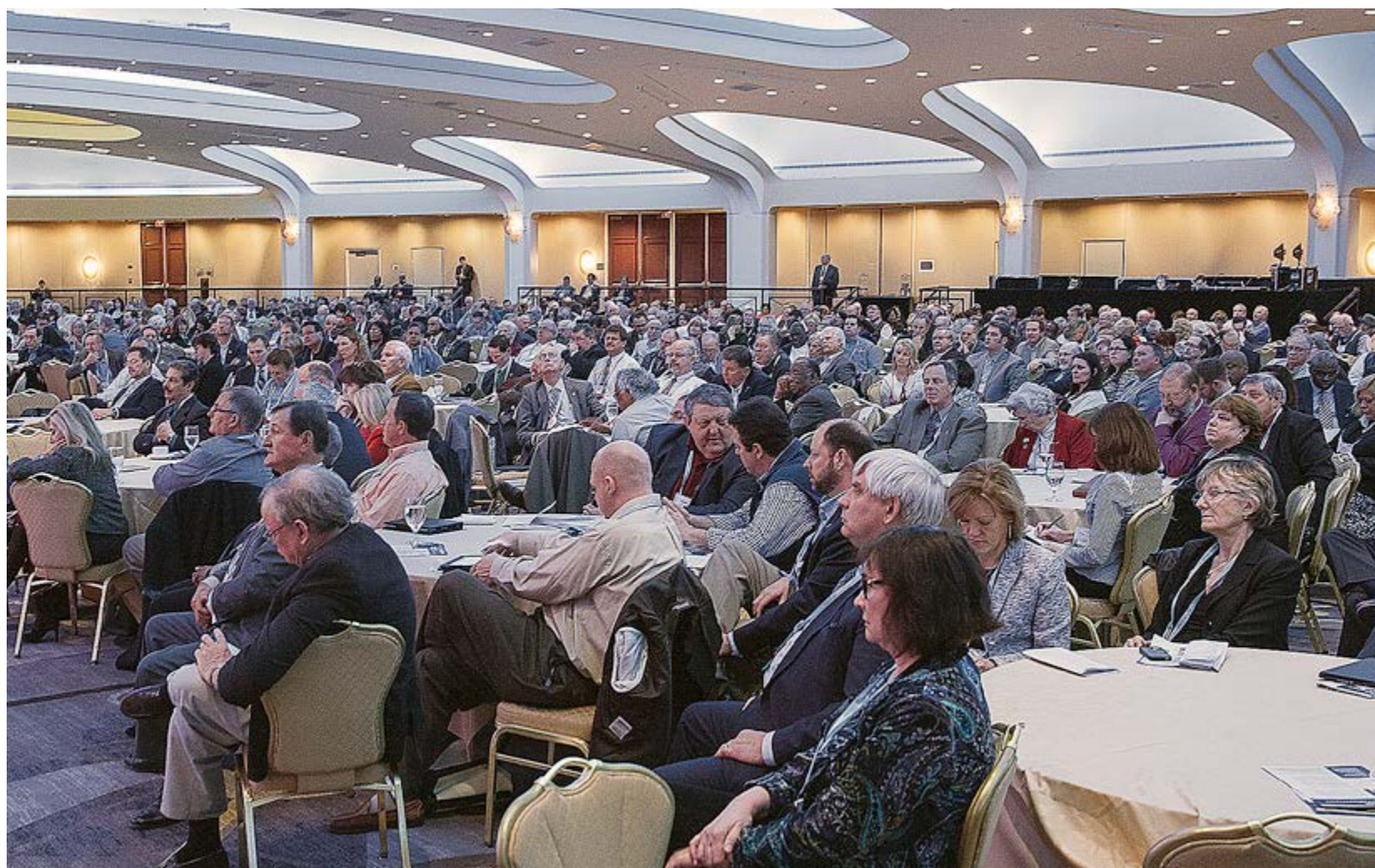
A General Session at the Legislative Conference attracts a large and engaged audience.