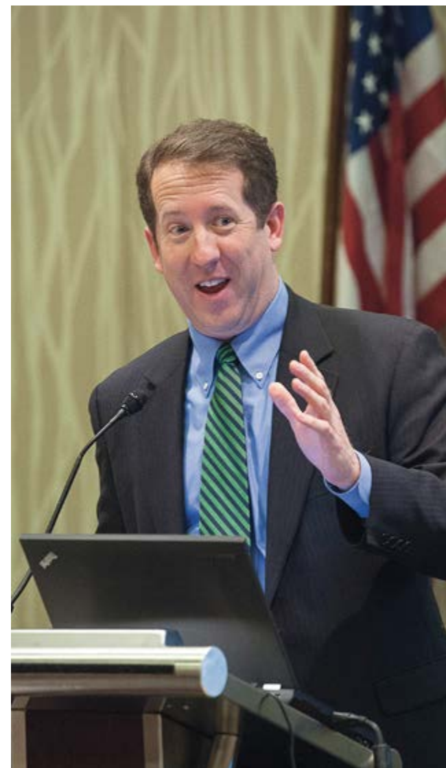
U.S. Rep. Adrian Smith (R-Neb.) speaks to members of Rural Action Caucus.