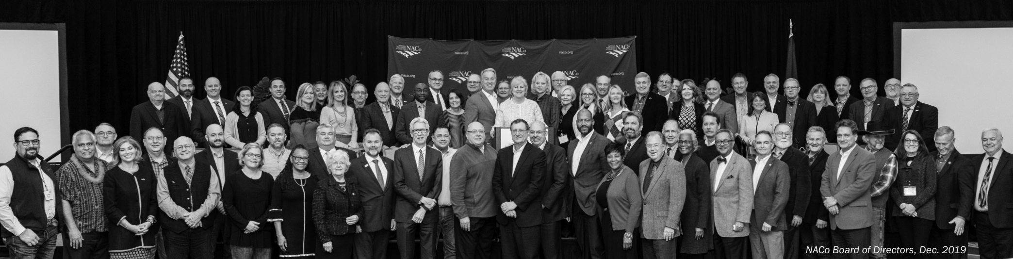
NACo Board of Directors, Dec. 2019