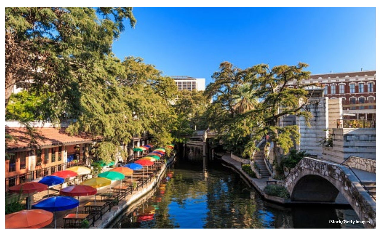
Bexar County, Texas

Building the knowledge and capacity of service providers helps sustain new practices. Implementing evidence-based programs often requires additional training and analytical capacity among service providers. Counties successful in raising the expectations of these organizations have balanced higher standards with additional supports, including training, education, and/or resources. Some counties have found success in creating forums where agencies, contracted provider organizations, and other community stakeholders can share information, clarify expectations, and help foster peer learning.