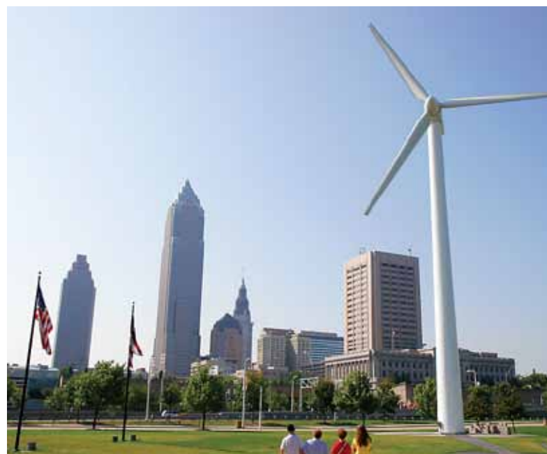
CLEVELAND from page 7