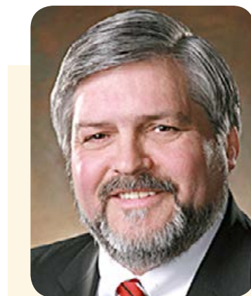
Commissioner Allan F. Angel Kent County, Del.

Unfunded federal mandates cripple the ability of local budgets