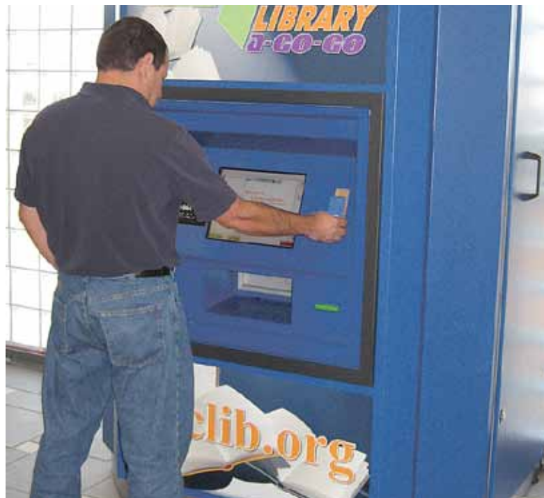
Contra Costa County, Calif. residents try out two of the county library's innovations that bring its resources out of its buildings: an automated book vending machine and QR codes that, when scanned by a smartphone, let a user access the county's mobile website, including a selection of downloadable digital books and audiobooks.

"We ended up being unable to serve much of our population, so we had to figure out how to extend service delivery without decreasing the services we offered," said