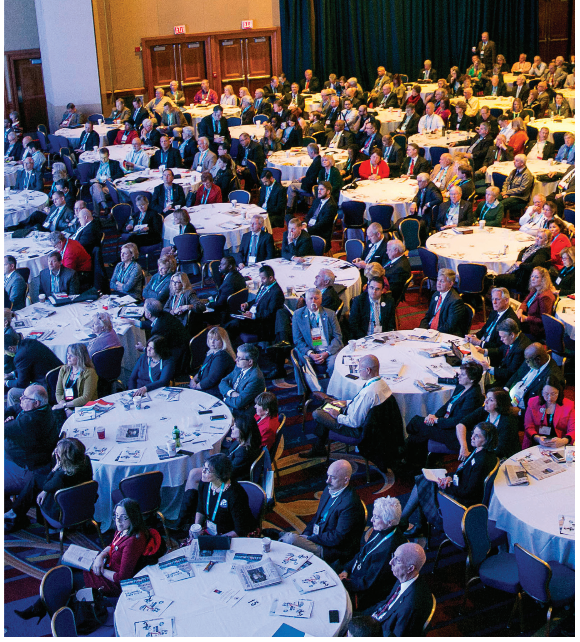
The scene at the Opening General session Feb.22.