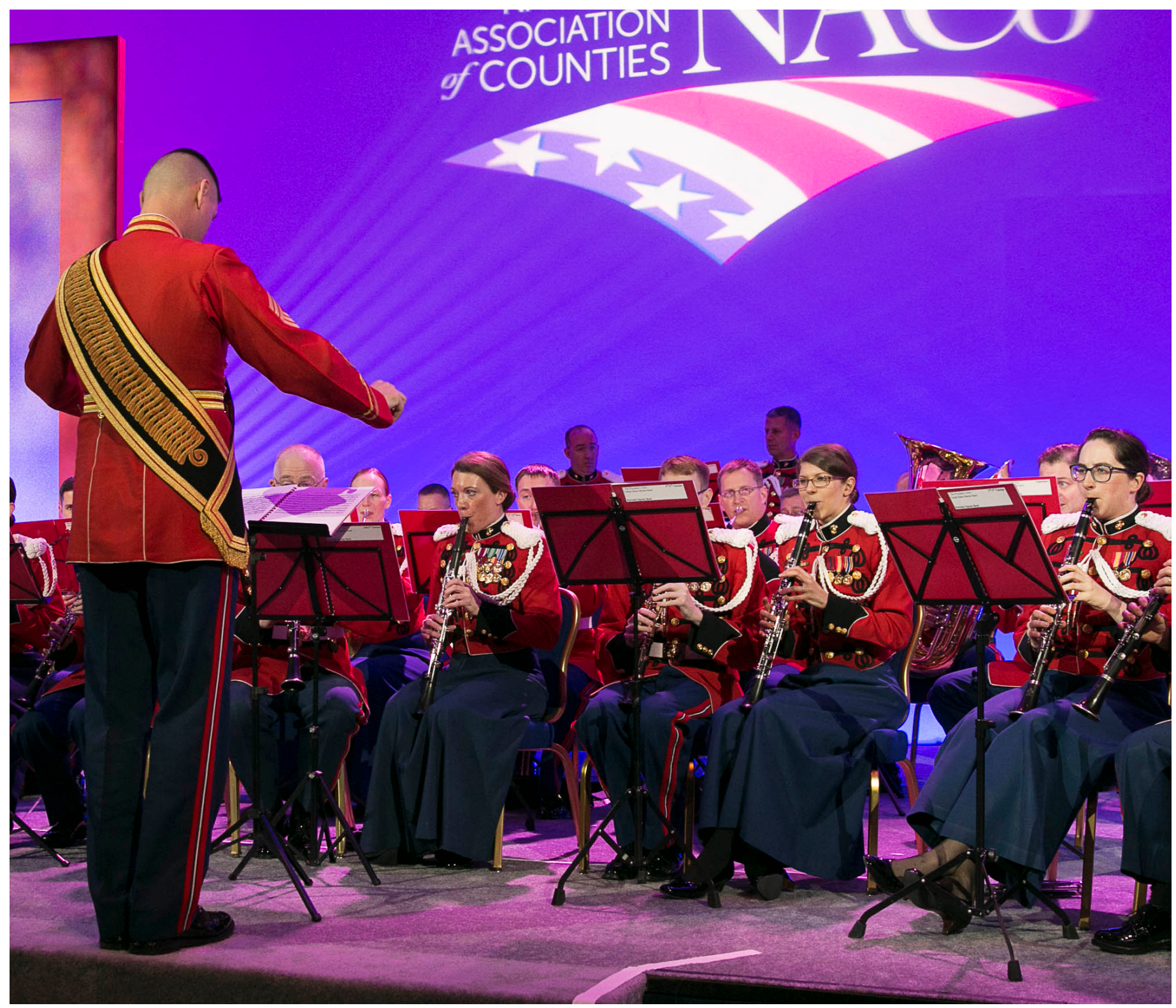
The \hbox{ $U$.S. Marine Corps band gets the conference started on the right note at the Opening General Session. } \\