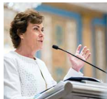
U.S. Sen. Jacky Rosen (D-Nev.) speaks to members of LUCC.