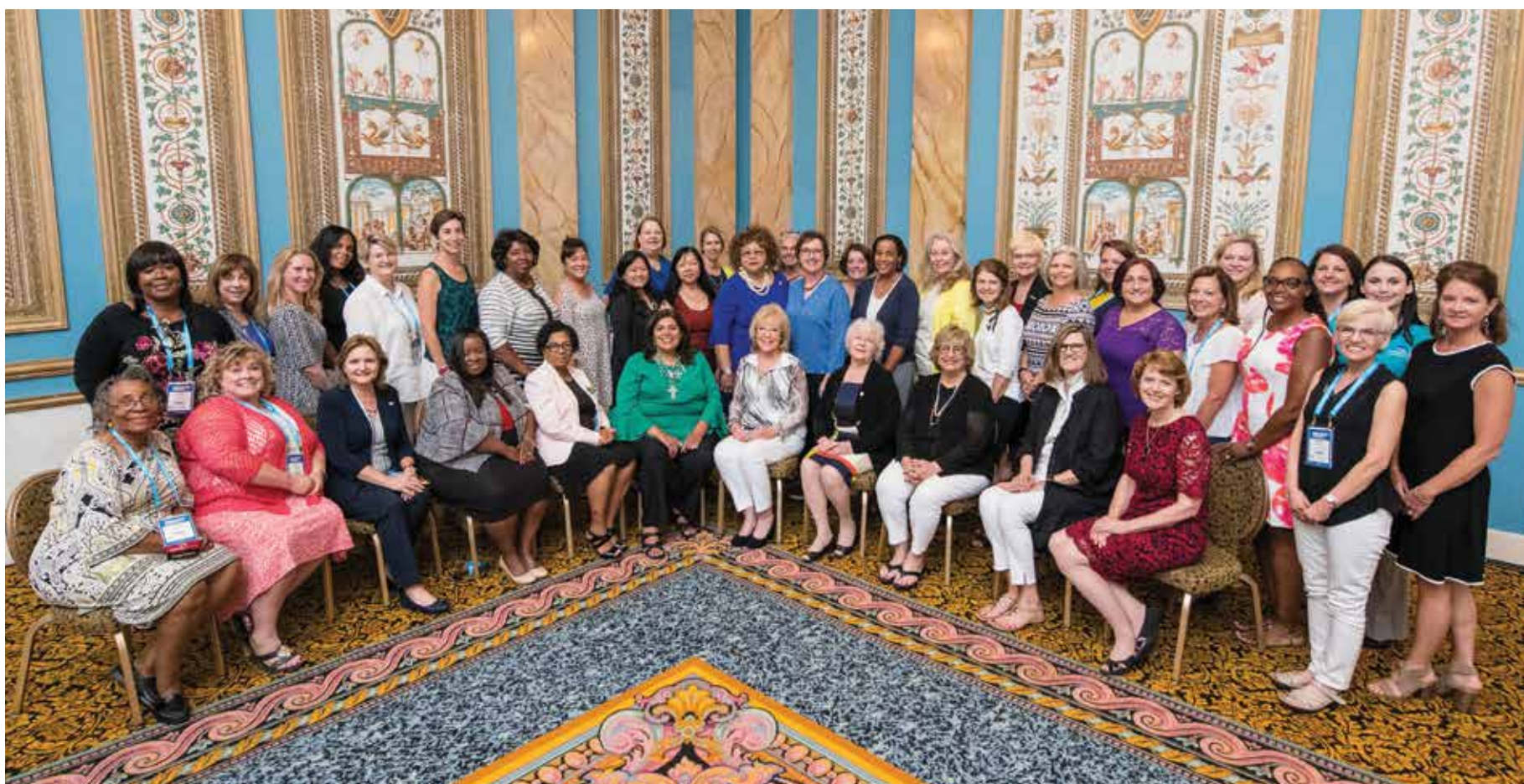
Members of the Women of NACo gather for a photo at the WON Leadership Reception at the 84th Annual NACo Conference in Clark County, Nev. Members enhance the effectiveness of female county officials and engage women officials in seeking leadership positions in their communities and within NACo.