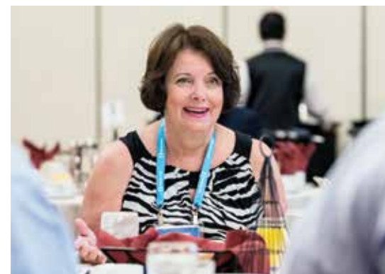
Blue Earth County, Minn. Commissioner Colleen Landkamer, a past NACo president, attends the newcomers' breakfast.