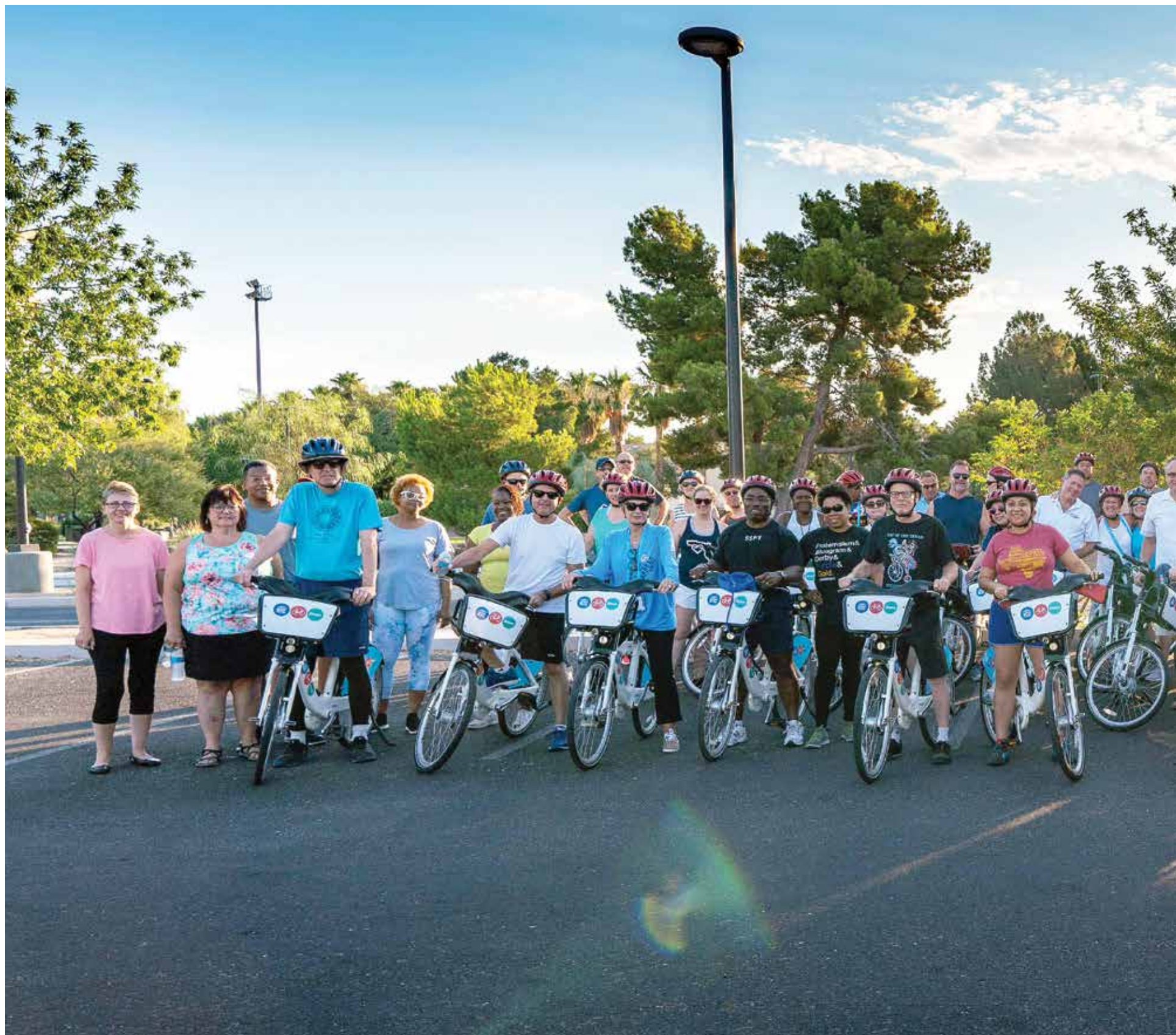
More than five dozen conference attendees line up for the Sunset Park Bicycle Ride, at sunrise, July 13.