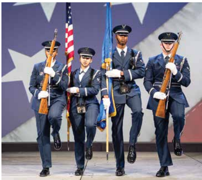
Members of the Nellis Air Force Base Honor Guard welcome NACo members to Clark County, Nev.