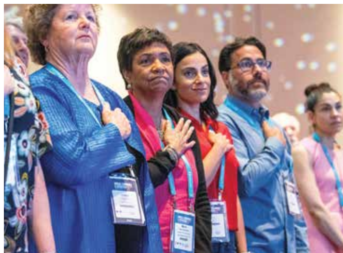
NACo members stand during the singing of the national anthem and Pledge of Allegiance at a General Session meeting at the Annual Conference in Clark County, Nev.