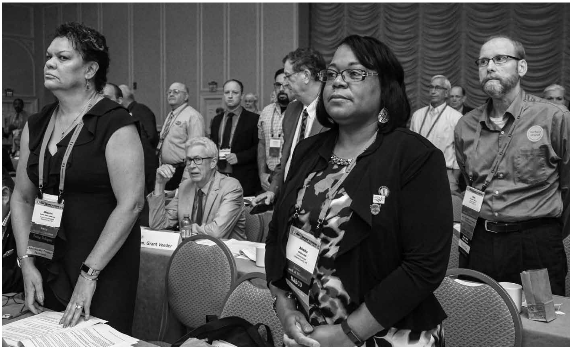
NACo Board members stand to register their vote during the resolutions process.

N ACo Board members, at their Annual Meeting, reaffirmed or adopted 107 new policy positions, touching on issues as diverse as sexual abuse in families to remediation of abandoned uranium mines.