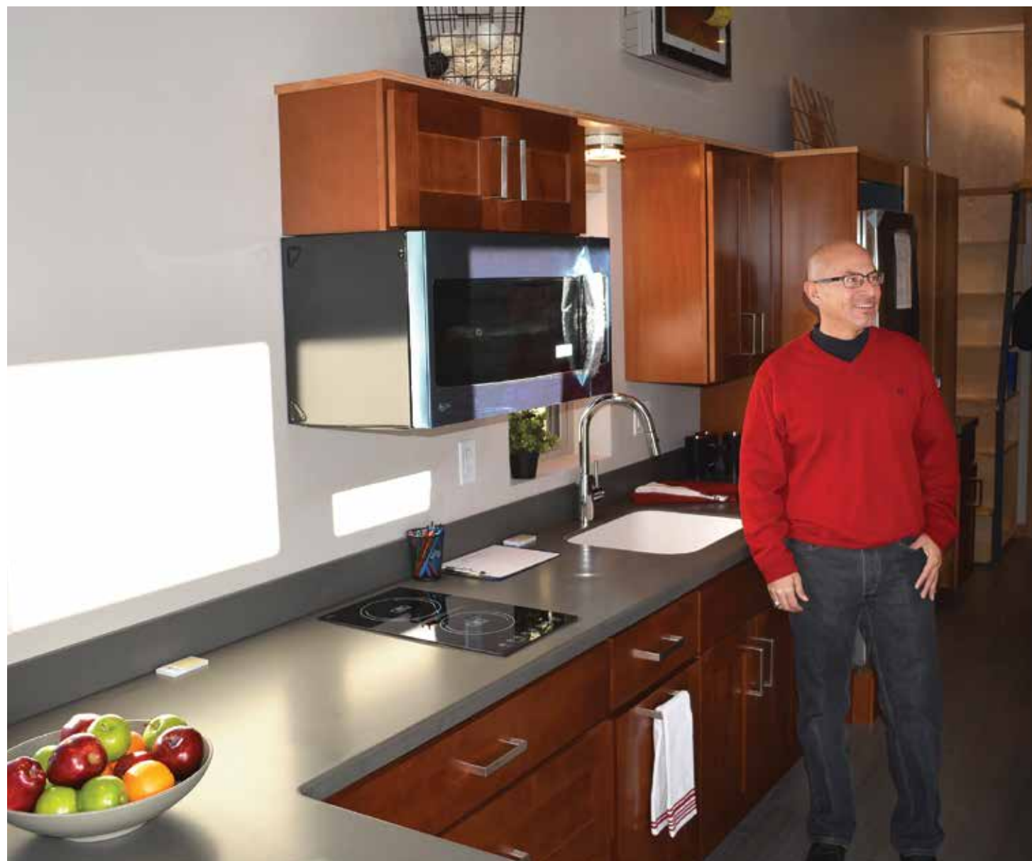
El Paso County, Colo. Commissioner Longinos Gonzalez, Jr. tours a tiny home during a December 2017 media event announcing the county's land development code to allow for more tiny home occupation.

tional) house for less than $400,000," he said. "This is an opportunity for people to buy a plot of land in a rural area, off the grid. People can be totally reliant on hauled water, solar power. There are small lots in canyons in Sedona where you can't build much else."