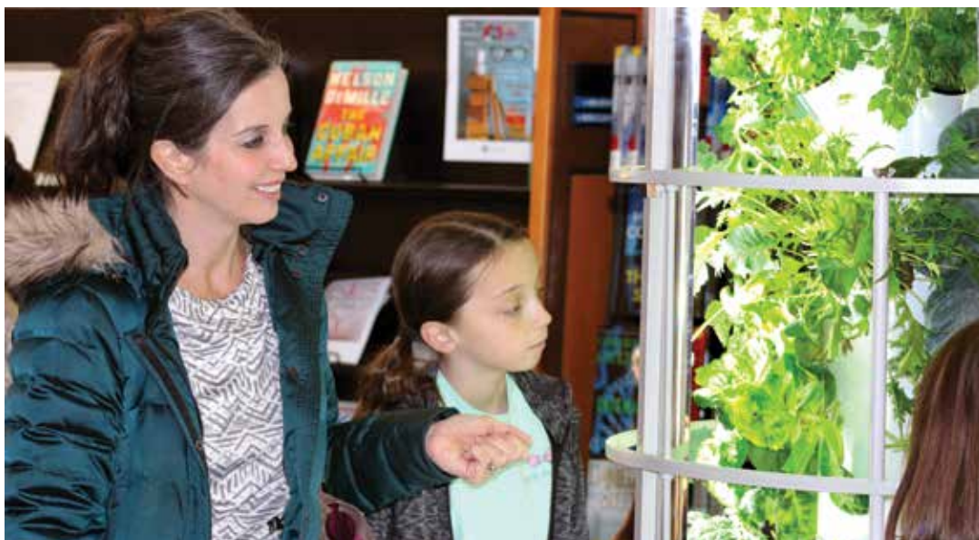
Library patrons stop to check out a tower garden at a Gwinnett County, Ga. library.