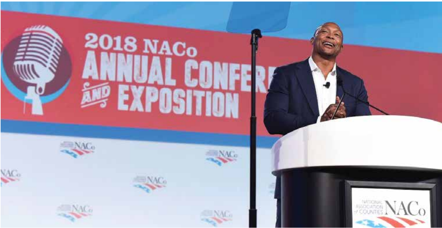
NFL legend Eddie George talks about the challenges he faced after his football career with NACo members July 14.

“They say an athlete dies twice,” he told the Opening General Session audience at NACo’s Annual Conference July 14. “As an NFL athlete, that being you created is now done. You’ll never compete on