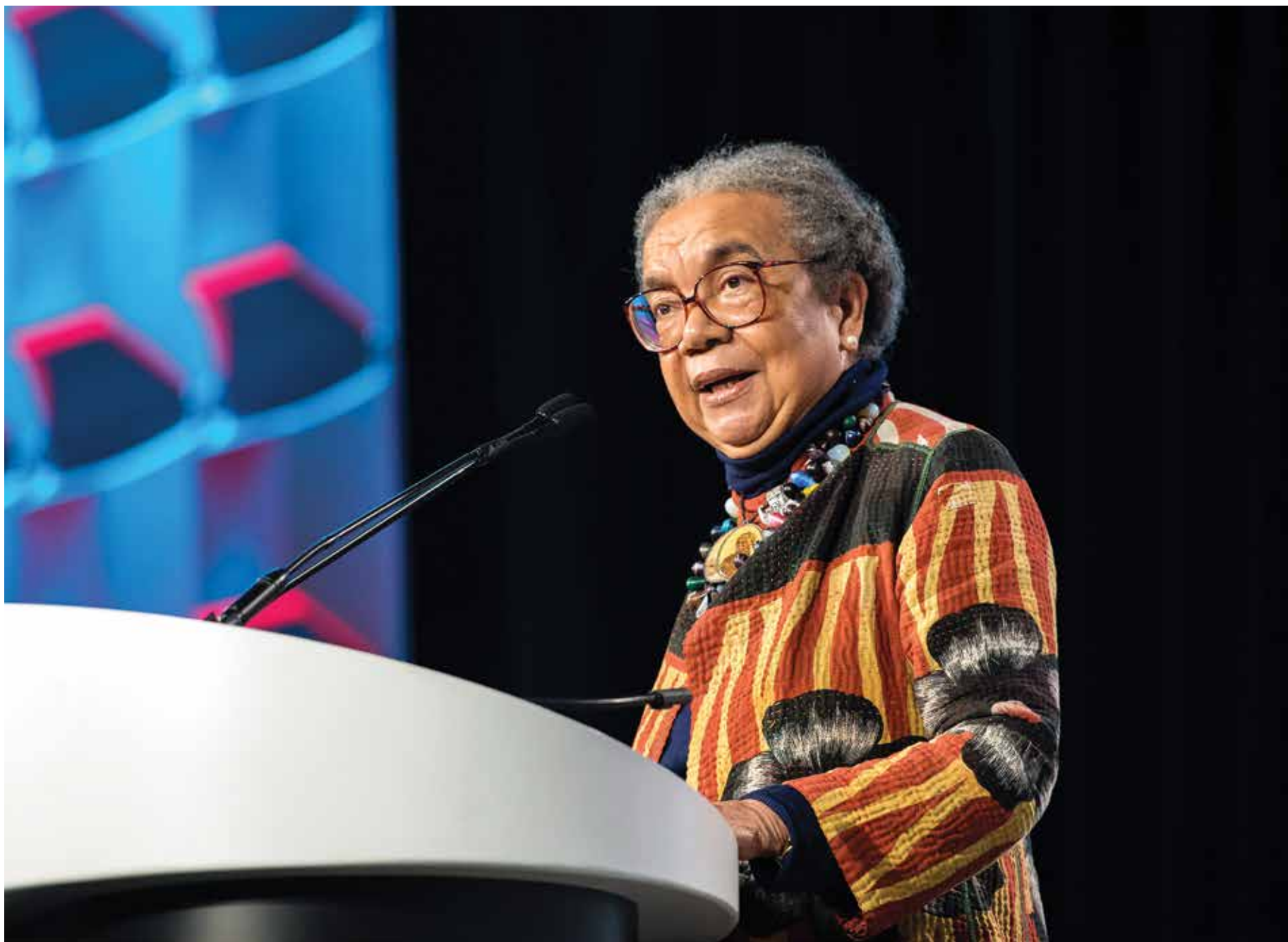
Child advocate Marian Wright Edelman urges county officials July 16 to join her in conquering childhood poverty.