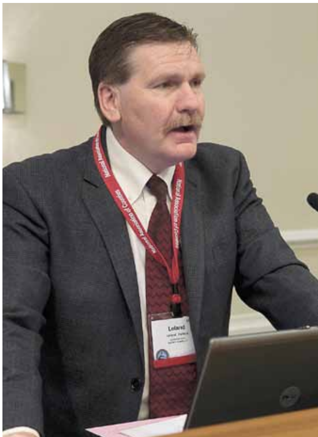
Leland Pollock, Garfield County, Utah commissioner, relays his county's experience with federal land use policies