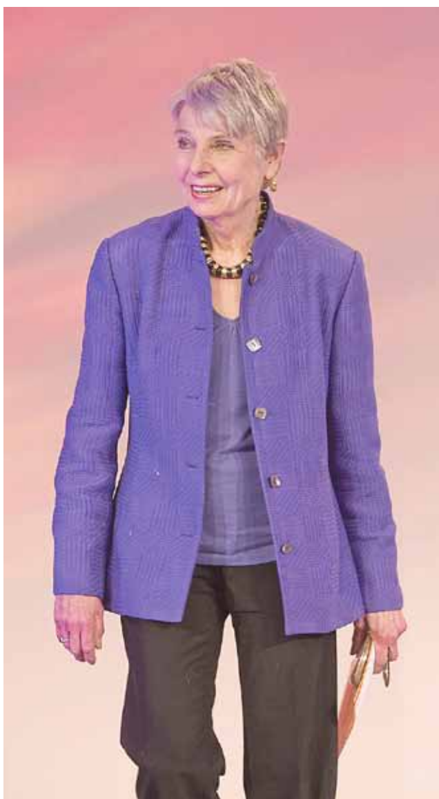
Ready for a friendly spat: conservative political commentator Tucker Carlson and liberal-leaning Eleanor Clift take the stage at the Opening General Session.