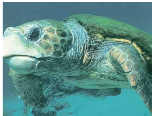
Loggerhead turtles begin nesting in May along the East Coast.

for baby turtles is artificial lighting along the beaches. These artificial lights cause the sea turtles to become disoriented and to go in the wrong direction heading inland rather than to the water, often to roads when they are crushed by cars or eaten by predators. Lee, Franklin, Brevard, Duval and Collier counties in Florida are a few of the many counties that regulate lighting on the beaches at night during nesting season.