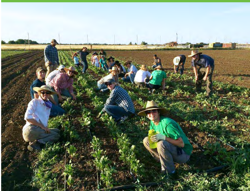
A class weeding beets at the California Farm Academy.