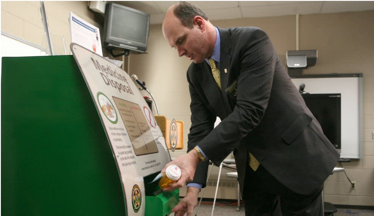
Hennepin County, Minn. Sheriff Rich Stanek shows how easy it can be to dispose of unwanted prescription medications, including opioid painkillers. By Alix Kashdan

After one or both are used, the person must complete an Overdose Reporting Form, which is submitted to the health department, before they can receive a replacement Narcan kit. It asks questions such as where the overdose occurred, how many Narcan doses were used, was 911 called and was rescue breathing performed?