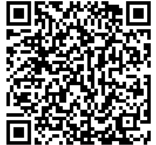
QR Code for NACo Blog on CISA CIRCIA Town Hall