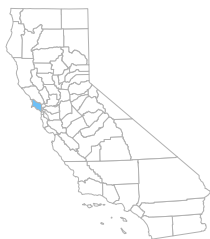
Marin County Calif.

The Maricopa County Probation Department's Justice-Involved Women Initiative aims to reduce recidivism by providing resources and assistance for female-centric needs to justice-involved women. The Initiative collaborates with treatment providers and community partners to offer gender-specific resources. Additionally, the department utilizes the Women's Risk Need Assessment used to develop gender-specific supervision plans.