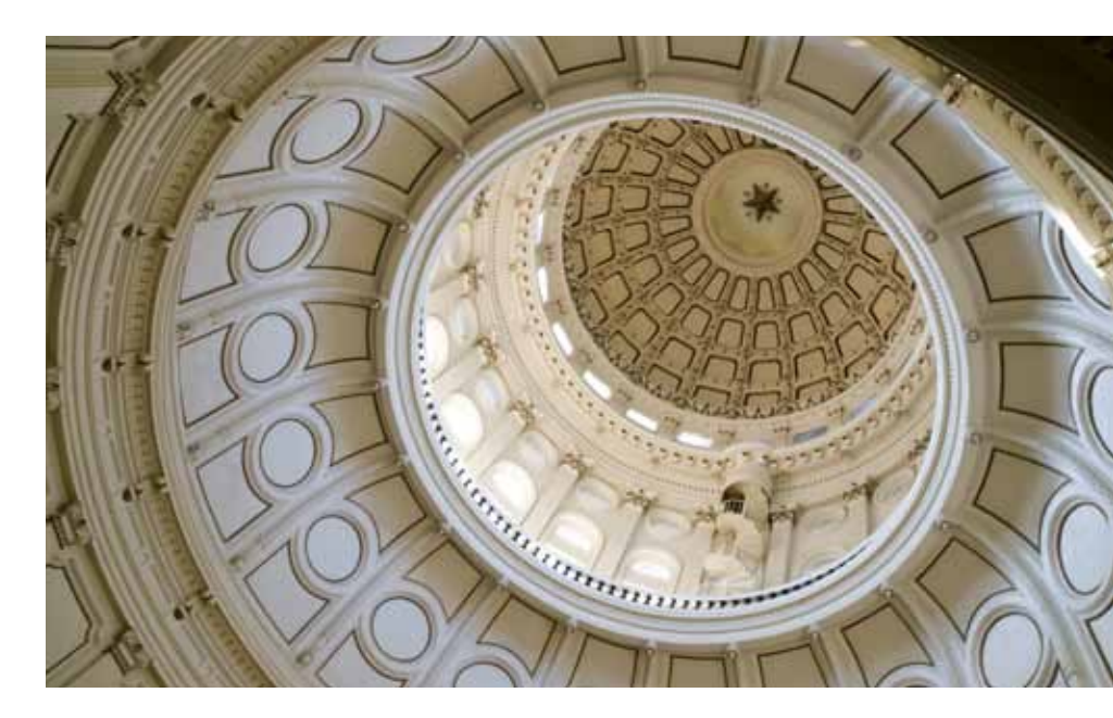
TO TABLE OF CONTENTS

Government CIOs and other executives need to do all they can to help improve security. Understanding security best practices, the latest challenges and the needs of their security teams can help CIOs and executives lead their organizations' security efforts now and in the future.