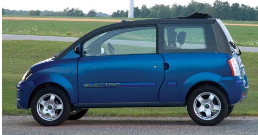
Zenn Electric Car

favorite Eco MC will both entertain and educate fair audiences on going green.