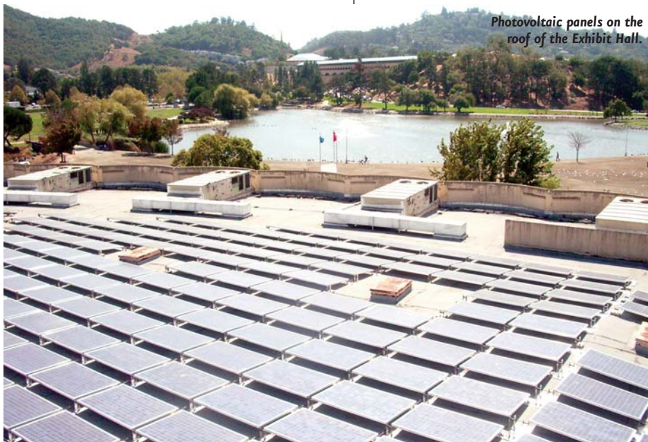
Photovoltaic panels on the roof of the Exhibit Hall.

Three thousand county fairs celebrate local traditions throughout the United States, from Maine to Maui, Alaska to Arkansas. The Marin County