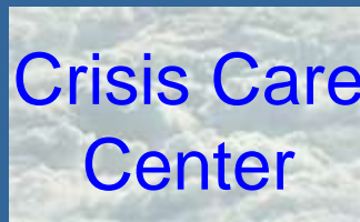
Crisis Care Center