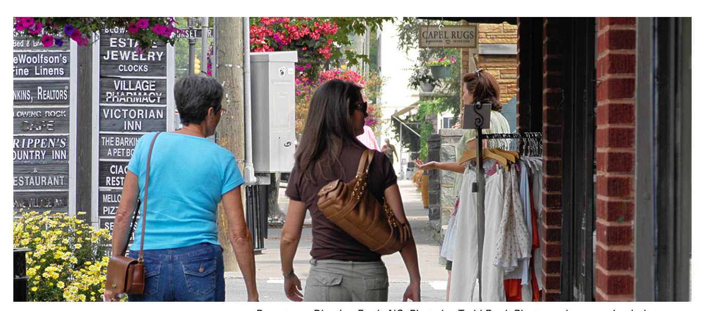
Downtown Blowing Rock, NC.

The biggest and most important benefit of a business improvement district is the positive development of the local economy. Before a neighborhood is declared an official BID, the area might be too dangerous or too run-down for consumers to frequent. Although there may be a few business owners who try as hard as they can to entice customers into the area, the neighborhood itself may lack adequate street lighting, policing, and signage. Additionally, consumers may stay away from the area because of dirty sidewalks plagued with crime and homelessness. A BID seeks to not only remove these examples of blight, but to improve the neighborhood beyond what would be the standard solution to the problem. A district that creates a safe night time environment will entice many late-night restaurants, bars, and theatres to locate their businesses in the neighborhood. These businesses will not only create a large number of both construction and service jobs in the area, but they will also increase property values, thus providing a strong property tax base for the local government.