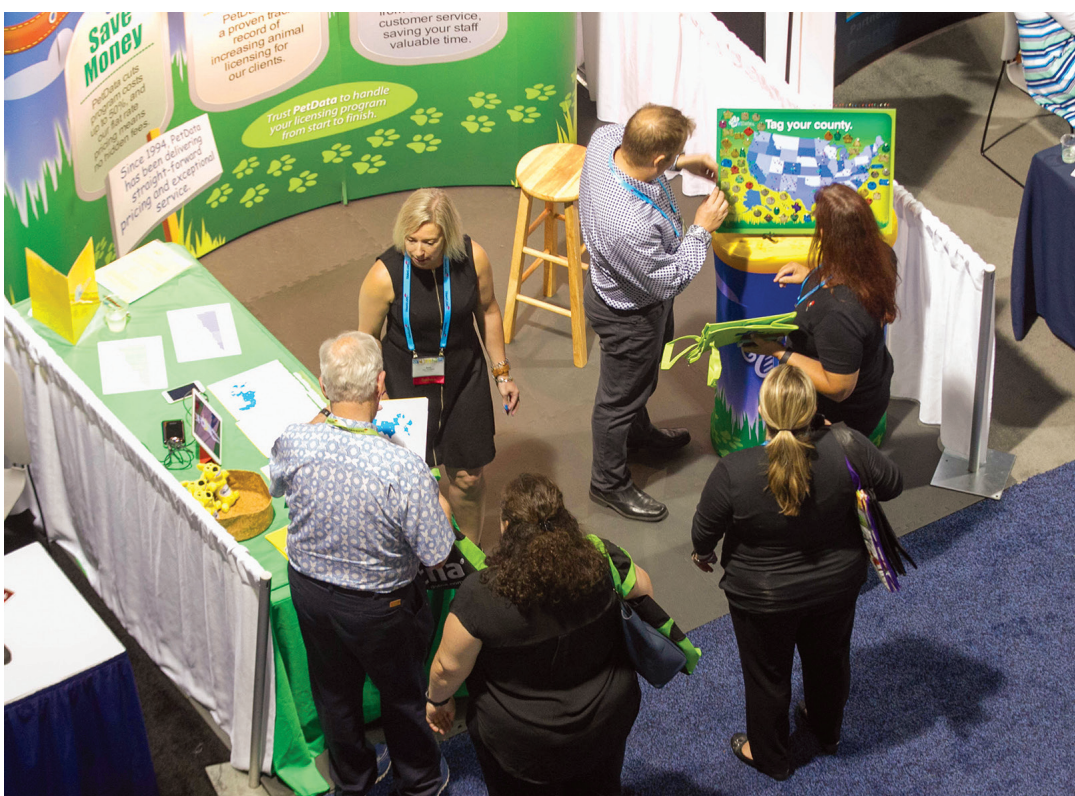
A bird's eye view of a pet licensing software vendor in the Exhibit Hall.