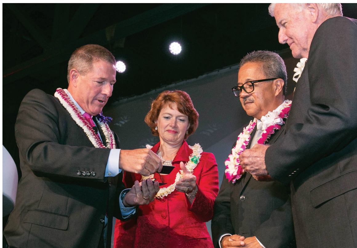
An honored NACo tradition: Executive Committee members trade their ribbons and they switch offices.