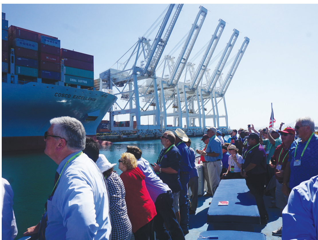
Mobile workshops included a tour of the Port of Long Beach.