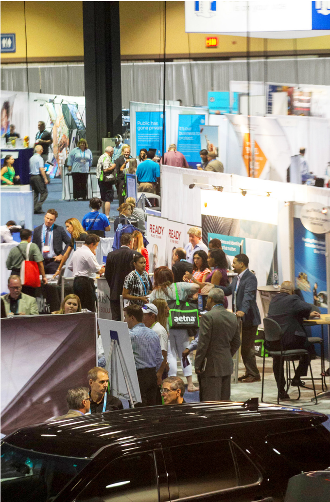
The Exhibit Hall offered vendors and attendees a chance to mix.