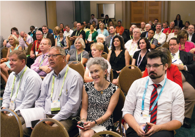
Managing the Relationship Between County Administrators and County Attorneys drew quite a crowd.