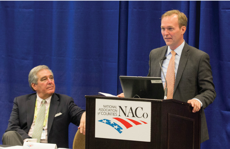
Salt Lake County Mayor Ben McAdams speaks during the Immigration Reform Task Force meeting as White House Director of Intergovernmental Affairs Jerry Abramson looks on.