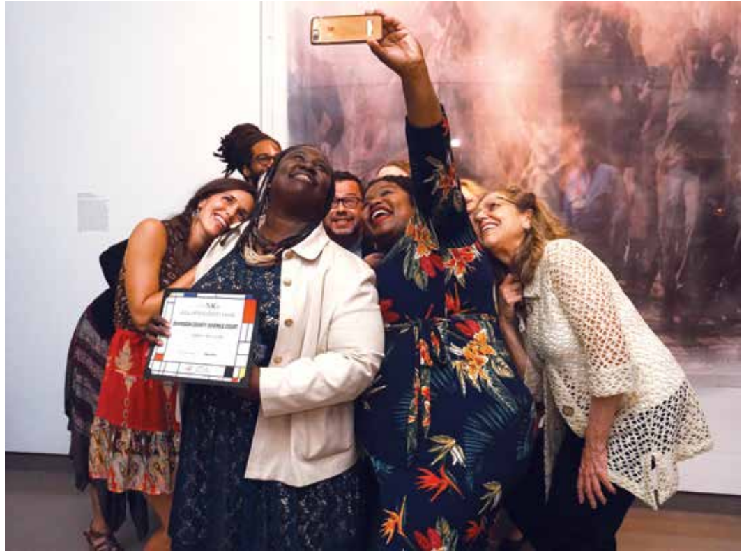
Always an opportunity for a selfie: Staff from the Local Leadership in the Arts Advocacy Award winner Davidson County, Tenn. Juvenile Court capture the moment.