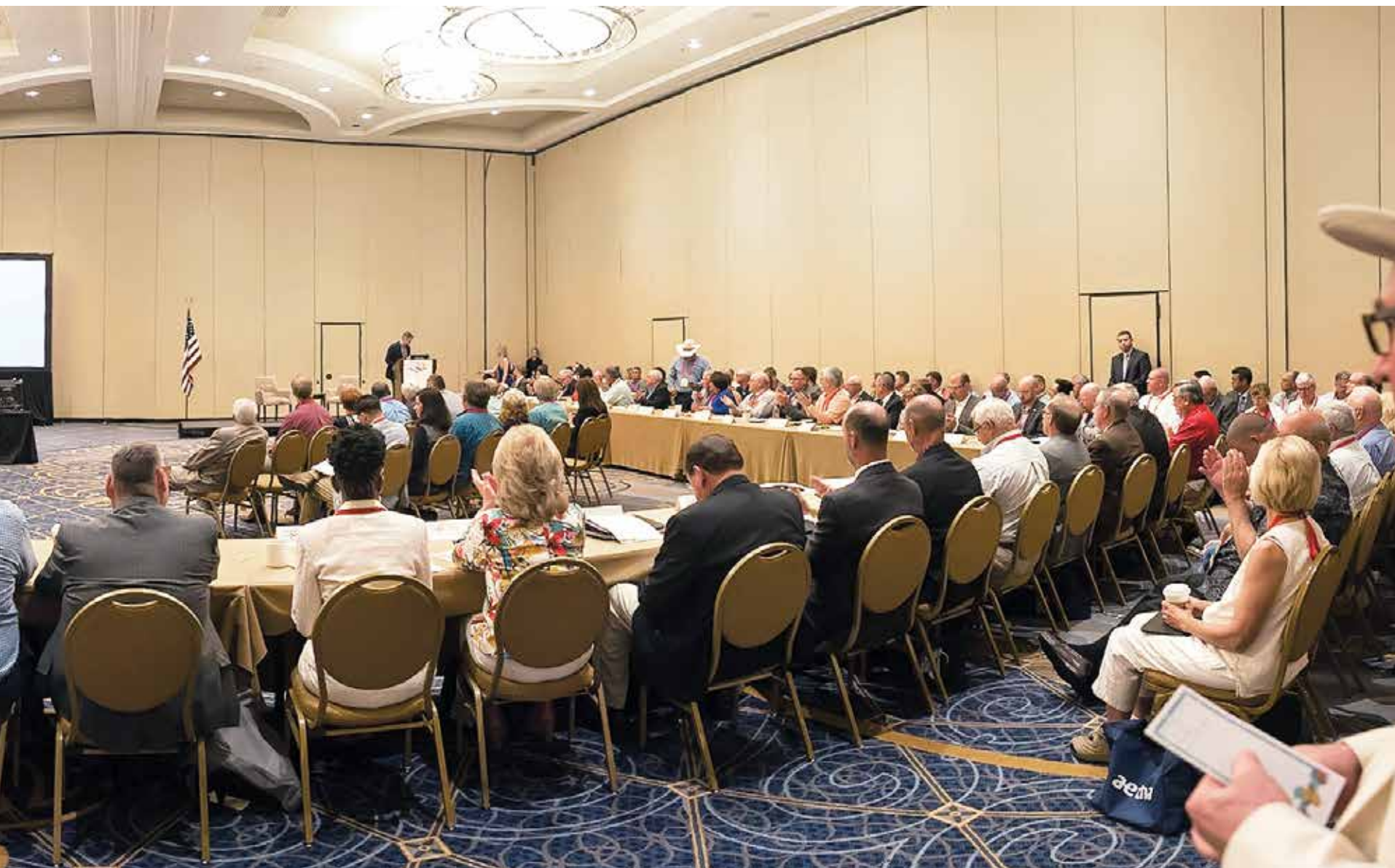
address the Rural Action Caucus.