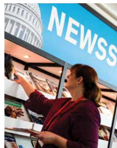
A NACo member peruses the newsstand at the Conference Resource Center.