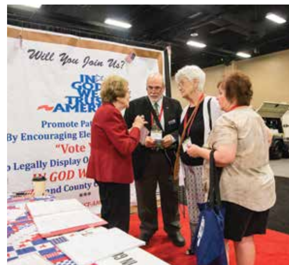
Advocacy groups found a home in the Exhibit Hall.