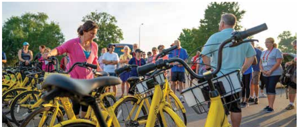
NACo members participate in a bike ride July 14 with bikes and helmets courtesy of ofo.