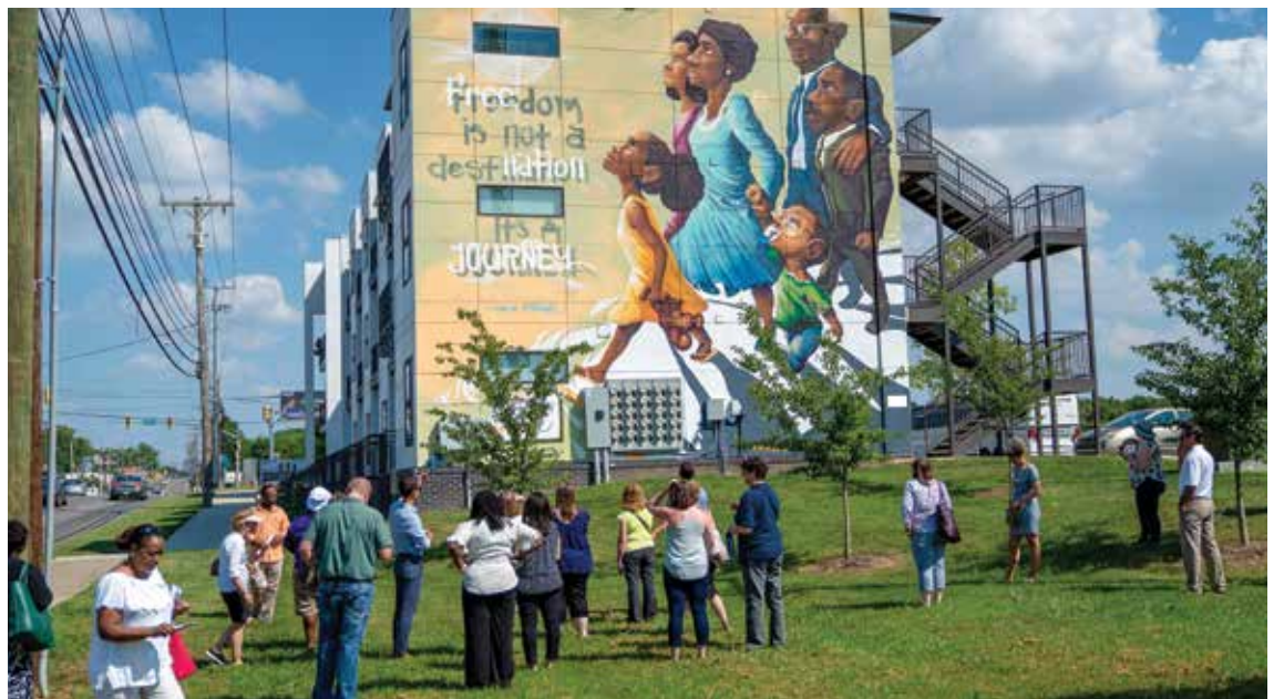
NACo members get a look at a neighborhood mural during the Affordable Housing Mobile Workshop tour in Davidson County, Tenn.