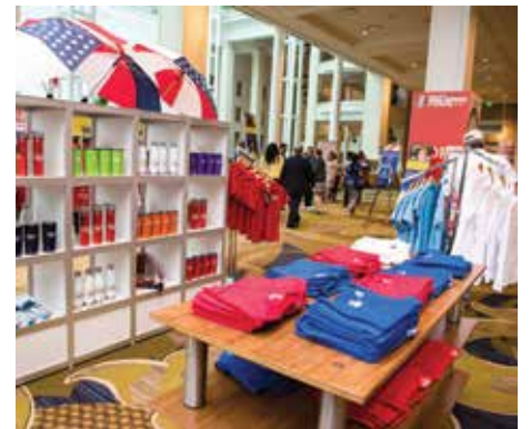
From umbrellas to water bottles — there is plenty of NACo merchandise for members at the Annual Conference in Nashville.