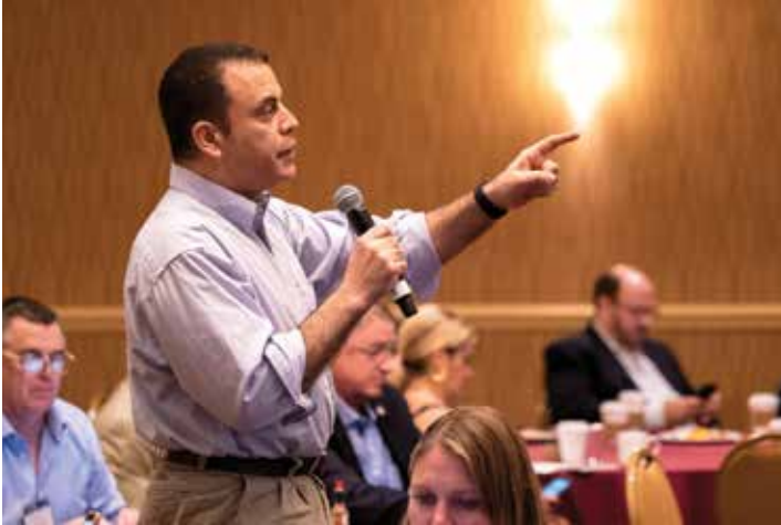
Commissioner Christopher Constance of Charlotte County, Fla. makes a point during the CIO Forum.