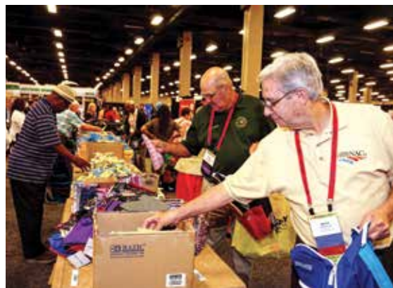
NACo members help stuff backpacks in Nashville.