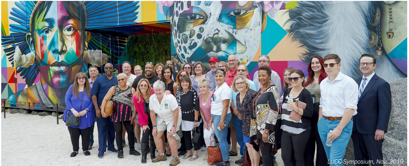
LUCC Symposium, Nov. 2019

A BIPARTISAN CAUCUS , LUCC meets in conjunction with the NACo Legislative Conference in Washington, D.C. each winter and at the NACo Annual Conference in July. Its annual Symposium, held in the fall, is emerging as the must-attend event for LUCC members to engage with federal policymakers, influencers and innovators from world-class philanthropic organizations, think tanks, academic institutions and businesses to foster creative and new public/private collaborations and partnerships.