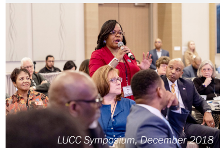
LUCC Symposium, December 2018

on justice and public safety services annually.